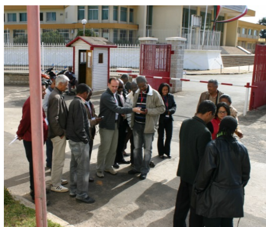
Photo no. 7 and 8: GPS-training outside and lecturing within the MDLC

As teachers should know what educational material would be available to them, there were ample demonstrations of the schemes to set up teaching a specific subject, the contents to teach, the relevant modules in the webcourse on this subject, relevant texts that can be downloaded and the UNGEEN material. The UNGEEN Secretariat had shipped manuals, glossaries and other printed material just in time for the course participants.