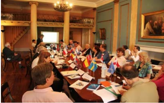
Photo no. 5: The Working Group during its consultations in the Royal Palace of Saint Michael and Saint George