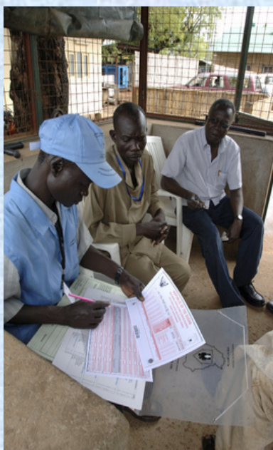
Population and Housing Census