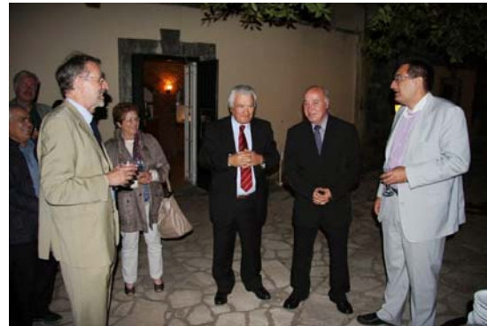
Photo no. 6: The Greek hosts welcoming the Working Group at the evening reception

Also as regards officiality , opinions were not at all uniform, although a qualified majority voted against making it a criterion of the definitions. This debate was related to the question, whether for standardization purposes official names, names in official languages or at least standardized names were not the most and perhaps even only important. It was argued that it was often difficult to find reliable sources for other than standardized names. It was, however, also emphasized that the definition of the endonym in the UNGEGN Glossary had to be all-comprehensive, had to include all kinds, status versions and linguistic forms of a name.