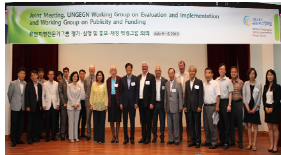
Photo no. 4: Participants of the Joint Meeting of the Working Group on Evaluation and Implementation and Working Group on Publicity and Funding with the Director General of the NGII, Suwon, Korea, July 2013.

Nations Conference on the Standardization of Geographical Names (UNCSGN) resolutions database was reported. The English and French versions are now working well with the 12 new resolutions from the 10 th Conference added. Next extension could be Spanish or Arabic, depending on the readiness of complete texts of the 207 resolutions adopted so far. This will be available with the technical and financial support of the NGII, the current host of the database.