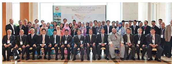
Photo no. 2: Delegates, Speakers and Participants of the Seminar on Geographic Naming with the theme of Placenames Preserving Cultural Heritage.

UNGEEN in New York decided to split the Asia South-East and Pacific South-West Division into two Divisions, the Asia South-East Division and the Pacific South-West Division (see E/2012/90, para 38). This decision was supported by a resolution of the 10th Conference on the Standardization of Geographical Names (Resolution X/5), which also recommends that both Divisions be granted full recognition as linguistic/geographical divisions of the United Nations Group of Experts on Geographical Names.