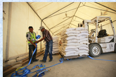
Delivery of Relief Supplies