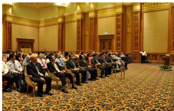
Photo no. 3: Seminar on Geographical Names during the presentation of papers.

The new UNGEGN Asia South-East Division is now comprised of twelve member countries which include Bhutan, Brunei Darussalam, Cambodia, Indonesia, Lao People's Democratic Republic, Malaysia, Myanmar, Philippines, Singapore, Sri Lanka, Thailand and Viet Nam.